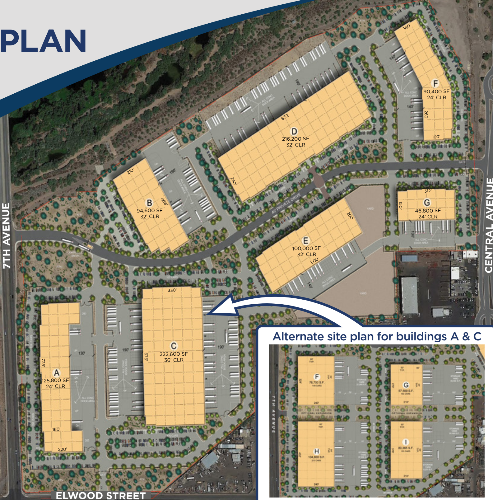
Alternate site plan for buildings A & C